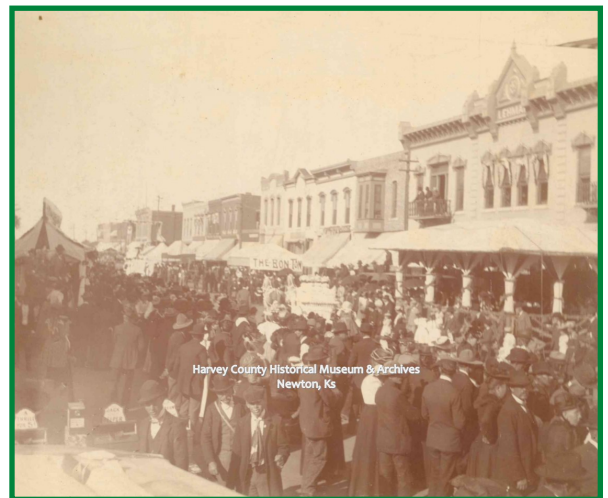
Harvey County Historical Museum & Archives Newton, KS